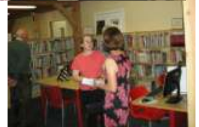
Community members enjoy the new library's spacious interior!