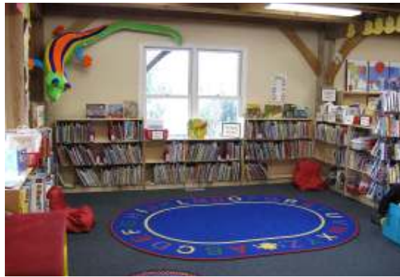
Our spacious and colourful new Children's Area is a hit with kids and parents!

The library also held special children's pro-