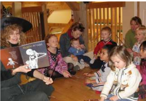
Children's programs encourage young library users